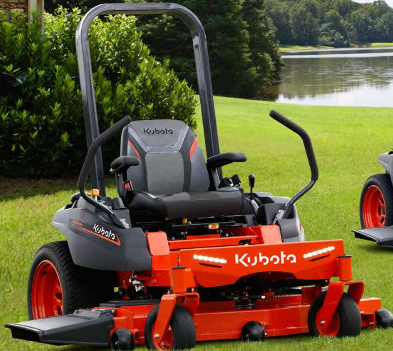
Z231KH/Z251KH with 48", 54" decks

Kubota's residential innovation turns mowing into a power trip and manages to keep your budget trim, too. The Z200 Series maneuvers through landscapes with comfort and ease. Have it all - style, comfort and performance, matched with Kubota's excellence in quality and durability. Engineered especially for the homeowners with exclusive, easy-to-use features.