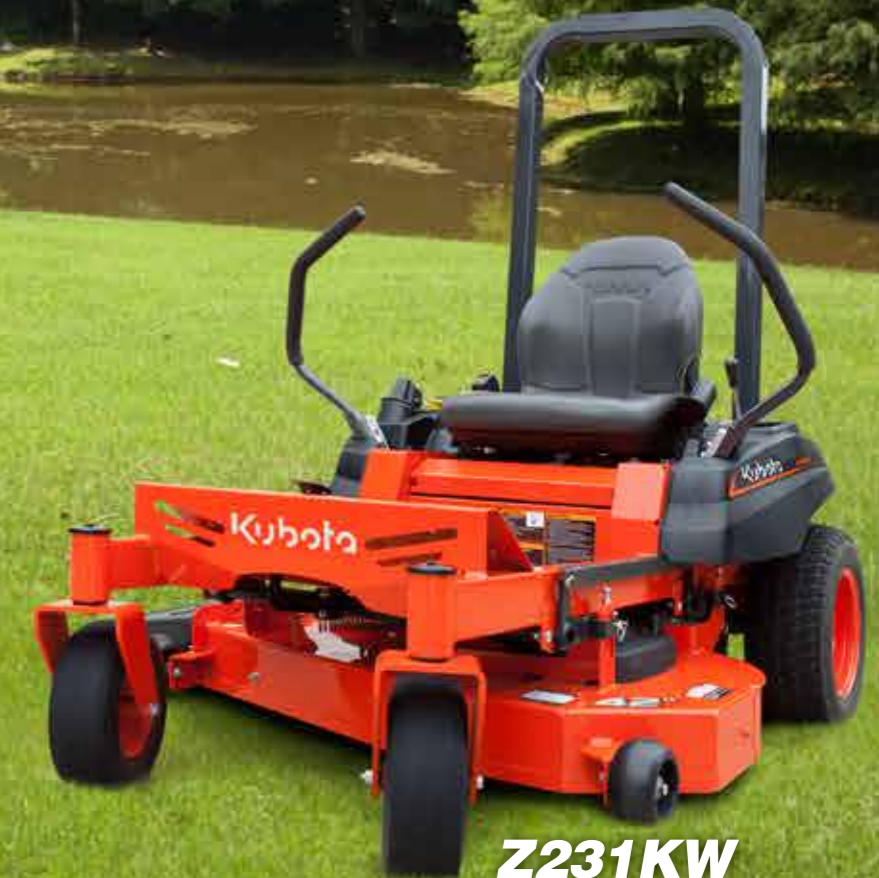
Z231KW with 42" deck

Mow Your lawn like a pro, with the smooth, effortless performance of the Z200 Series.