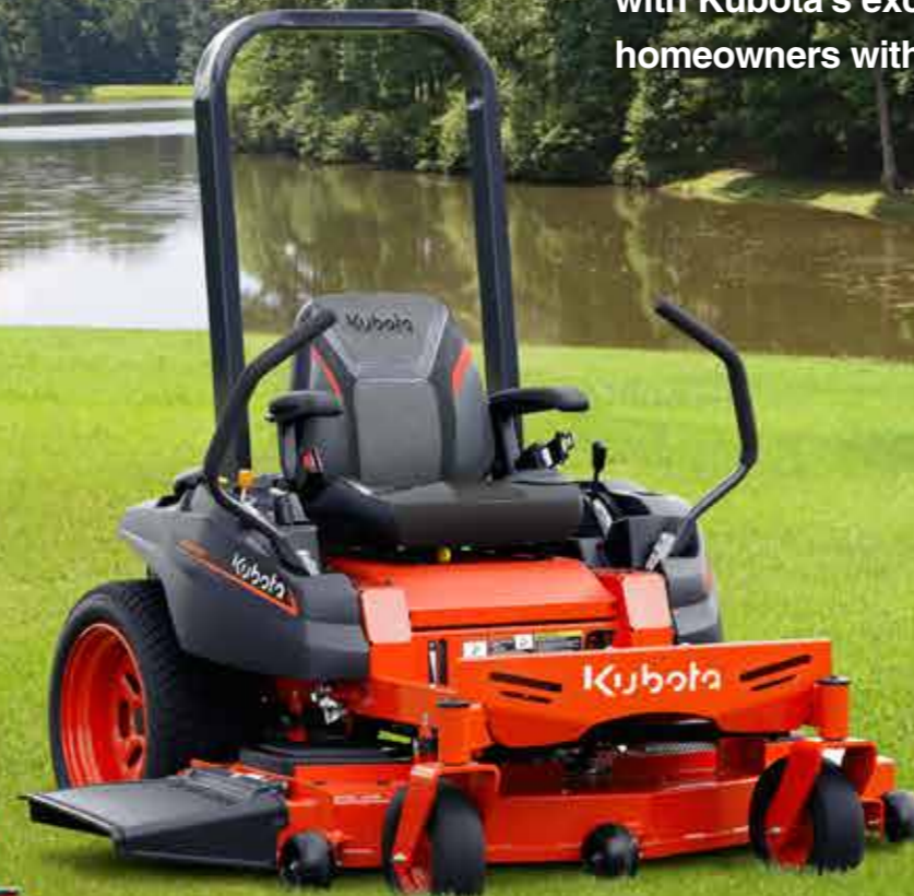
Z231BR/Z251BR with 48", 54" decks

Equipped with LED Headlights and Full Seat Suspension