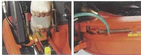
To clean the rear of the duct

Our Quick Clean System raises productivity by making it a snap to clear even wet grass without leaving the driver's seat. Simply use the lever to easily clear a path to the grass collector.