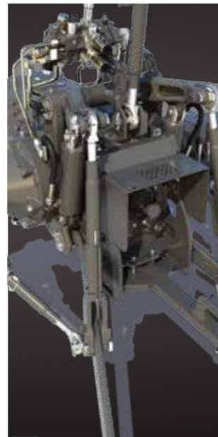
Page 9 Linkages and Axles