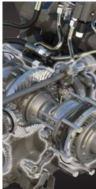
Page 7 Transmission