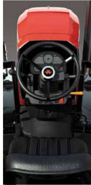
Page 5 Easy on the operator