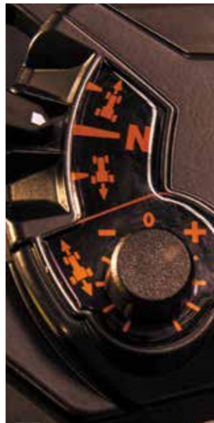
Page 8 Power Shuttle