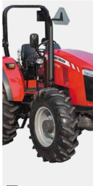
Page 3 Global Series