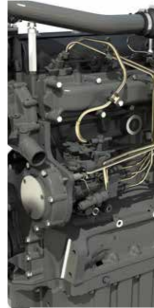
Page 6 Engines