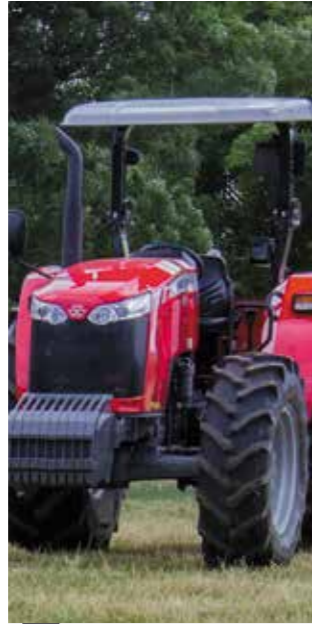
Page 4 New workhorses of the world