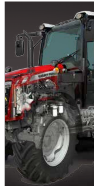
Page 10 Product Features