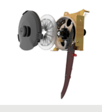
Clear-Shot<sup>®</sup> Seed Tube