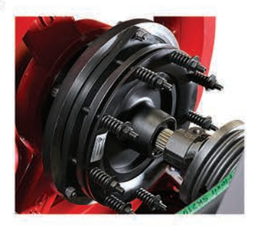
Auto-Reset Driveline Clutch

Using the LCD screen display, the in-cab tablet provides fingertip control of all baler functions.