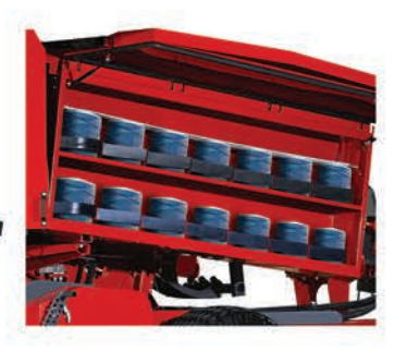
21 Twine Spools

Top and side shields fully open to easily access all components. The stuffer, rotor and chamber also have dedicated clean-out doors.